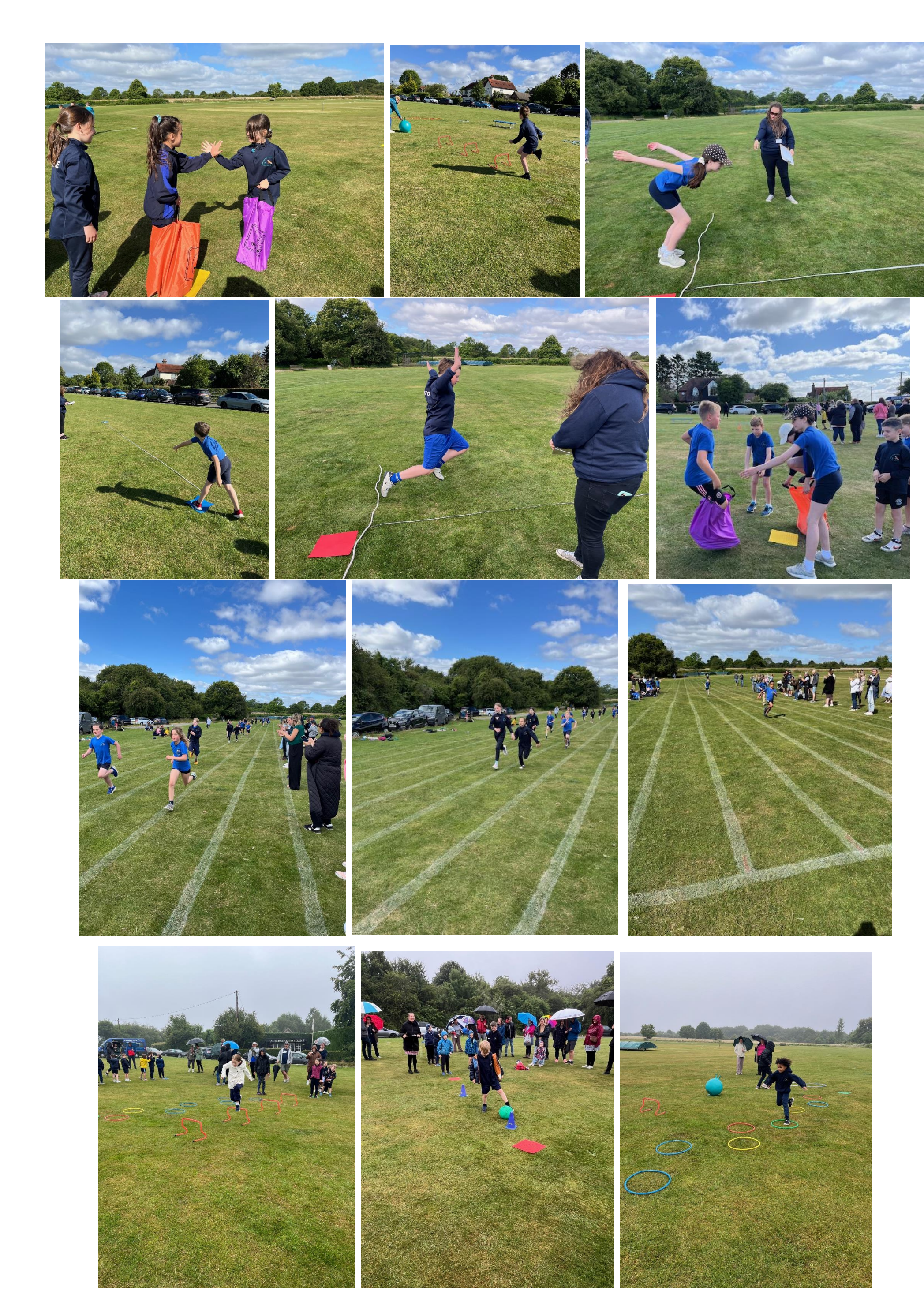
Love – Courage – Respect – Community – Perseverance 'Whatever I have, wherever I am, I can make it through anything in the One who makes me who I am' Philippians 4:13